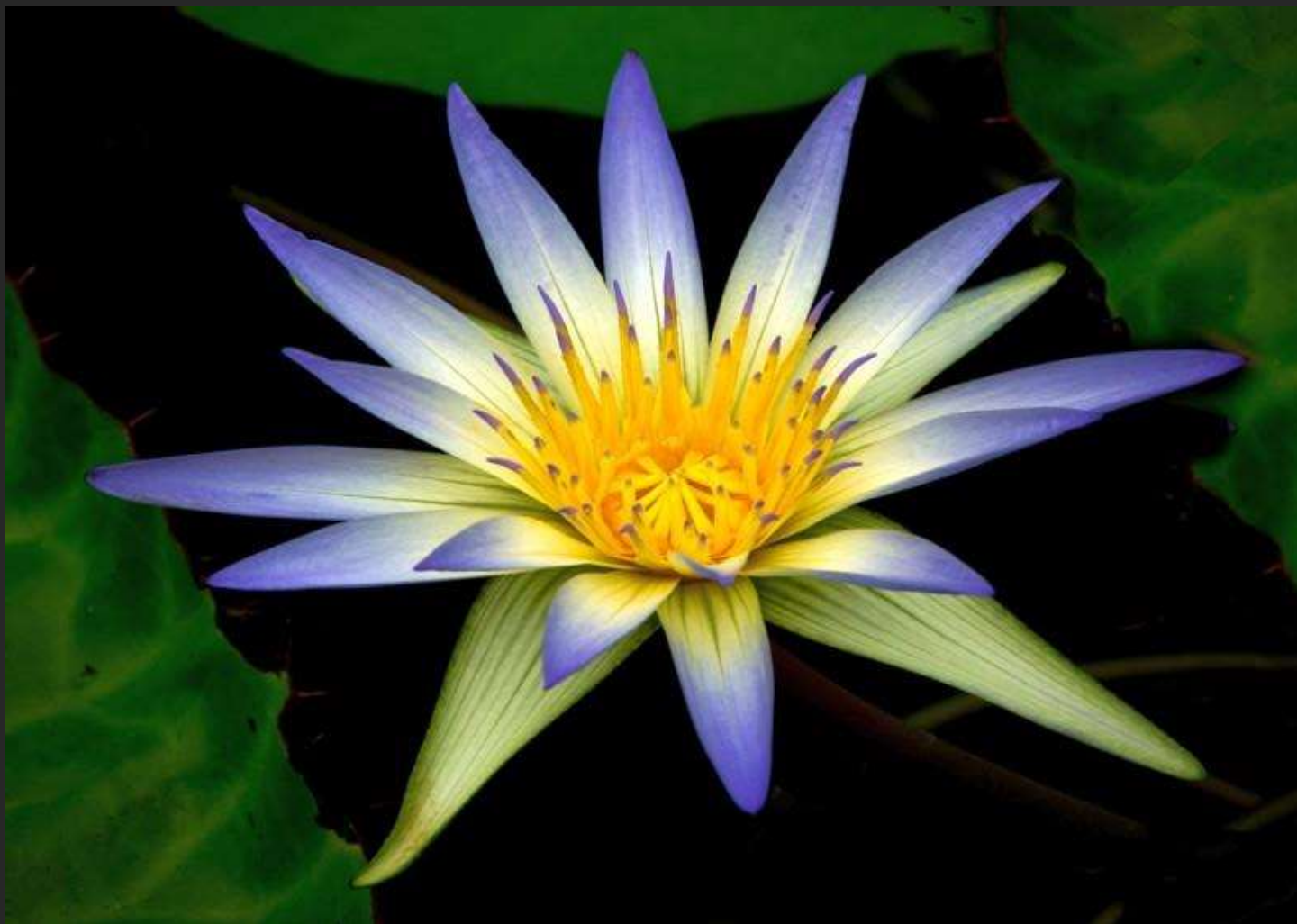
CAVE ANTHONY, AUSTRALIA - WATER LILY - PSA BEST OF SHOW – INDORE