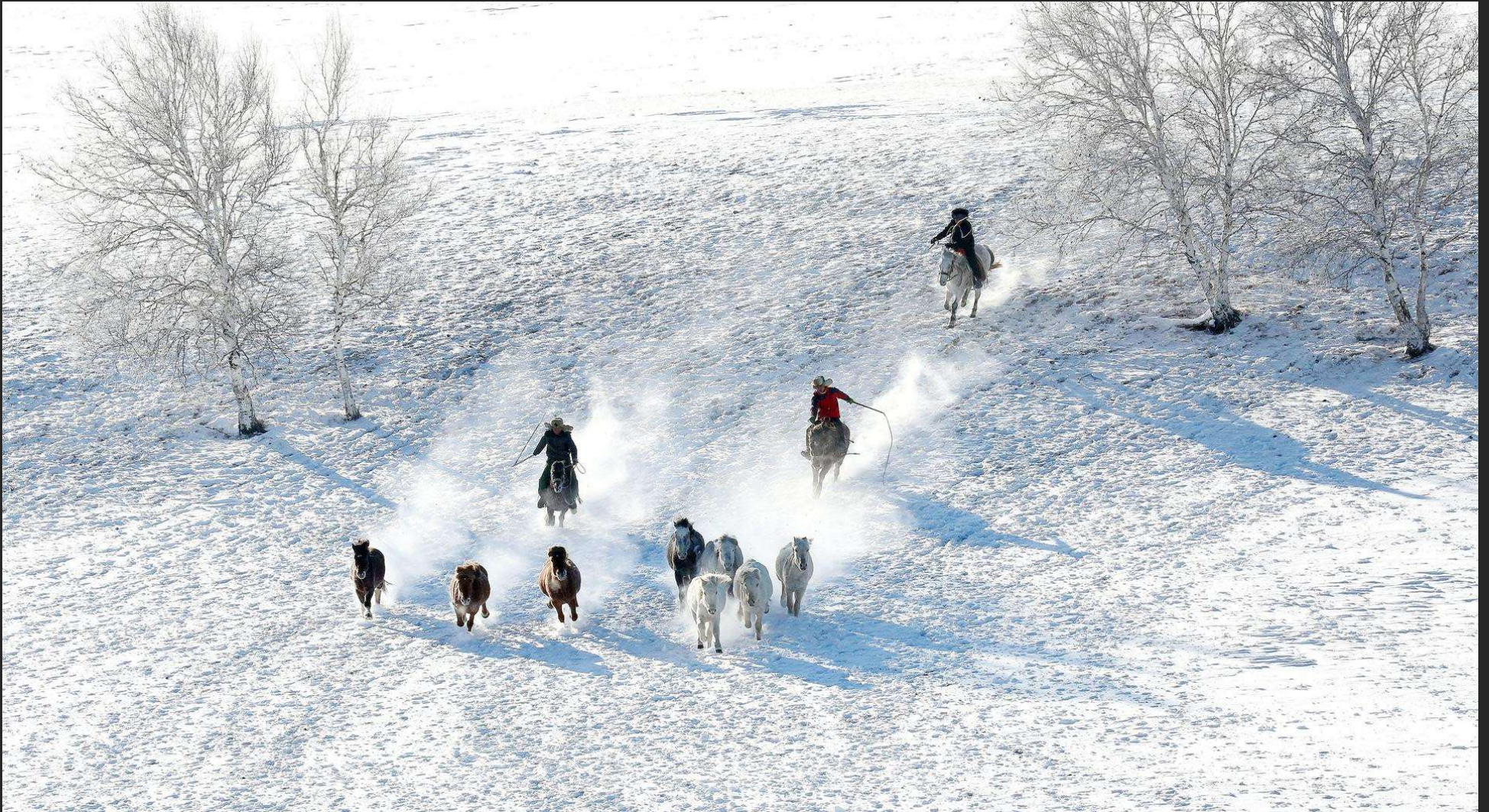
WANG LI, CHINA - HORSE RUNNING - FIAP GOLD MEDAL – BHOPAL