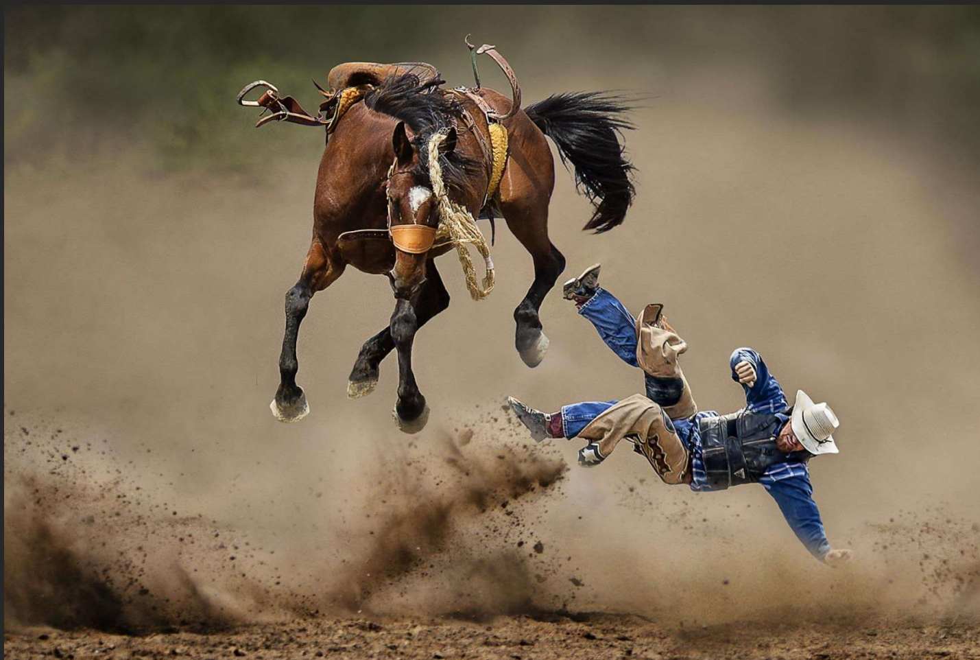
TAM KAM CHIU, CANADA - THE MAD HORSE - PSA BEST OF SHOW – UJJAIN