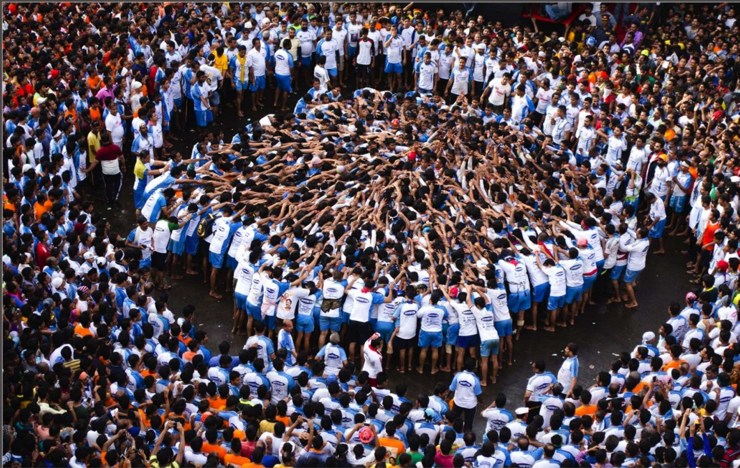
JAGUSTE VAIBHAV, INDIA - OATH - PSA BEST OF SHOW – BHOPAL