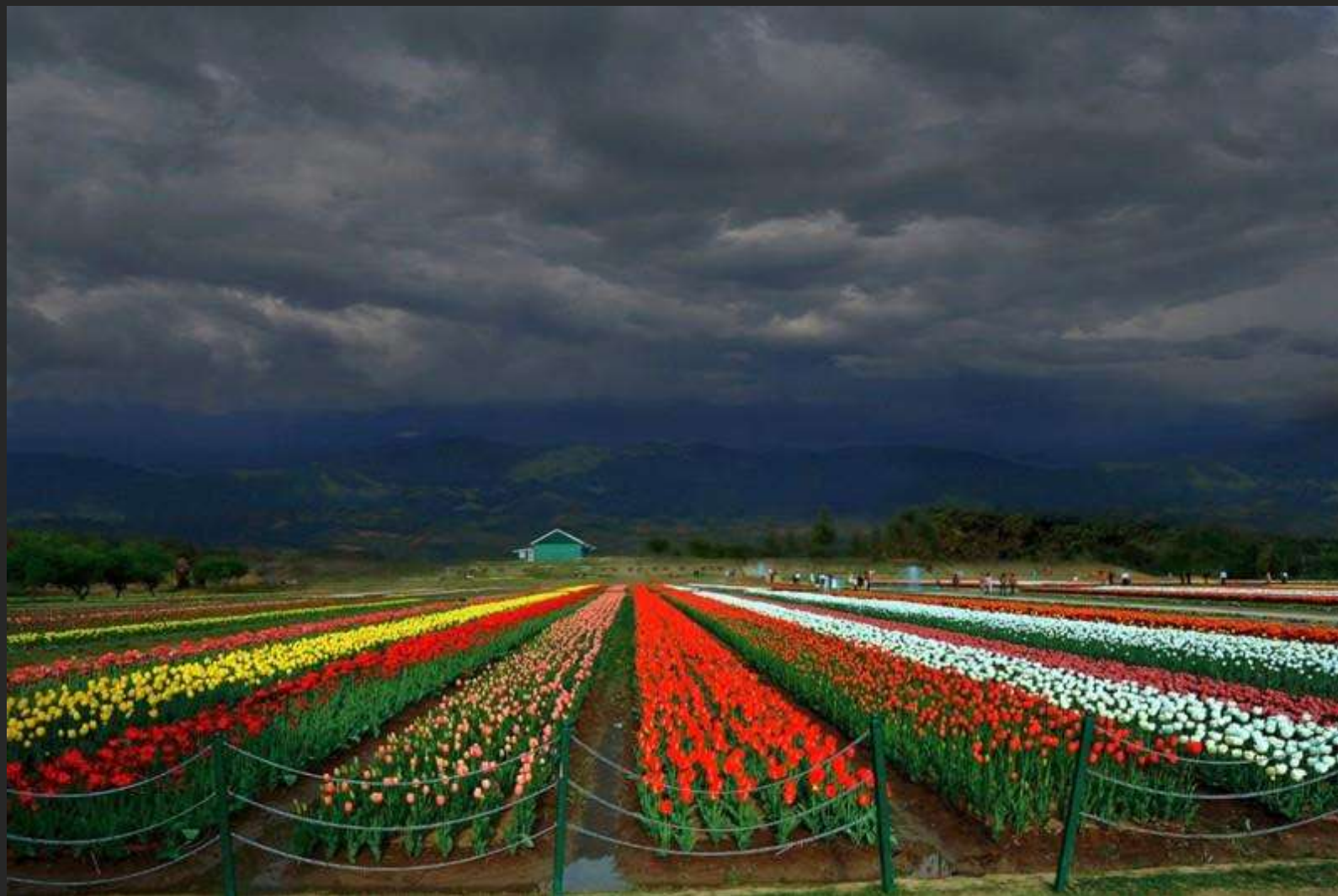
DAS APURBA, INDIA - AFTER RAIN - FIAP SILVER MEDAL – INDORE