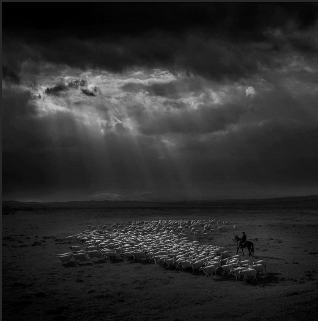
ZHOU JIANYONG, CHINA - BACKING HOME AFTER GRAZING - FIAP GOLD MEDAL – BHOPAL