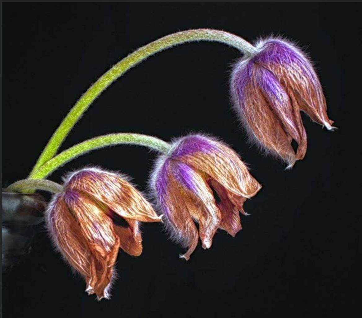
TERRANCE BILL, UNITED KINGDOM - DYING FLOWERS - FIAP GOLD MEDAL – UJJAIN