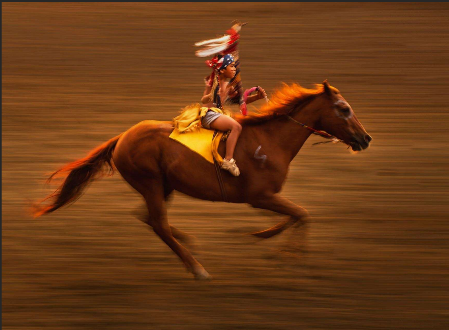
LI WENYUAN, UNITED STATES - BRAVE BOY - PSA BEST OF SHOW – BHOPAL