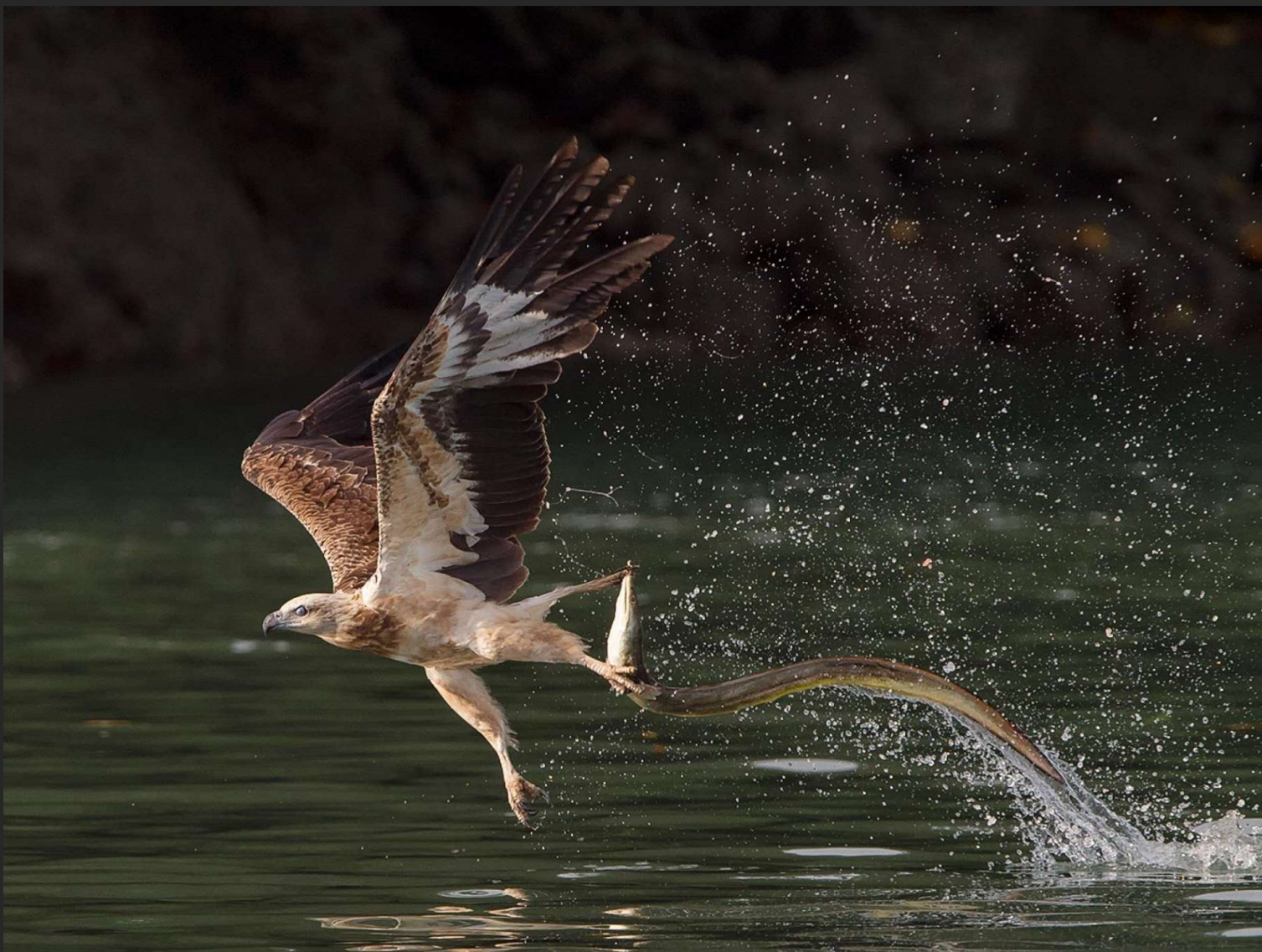
CHEUNG KOON NAM, HONG KONG - SEA EAGLE AND EEL 3 - FIAP SILVER MEDAL – BHOPAL