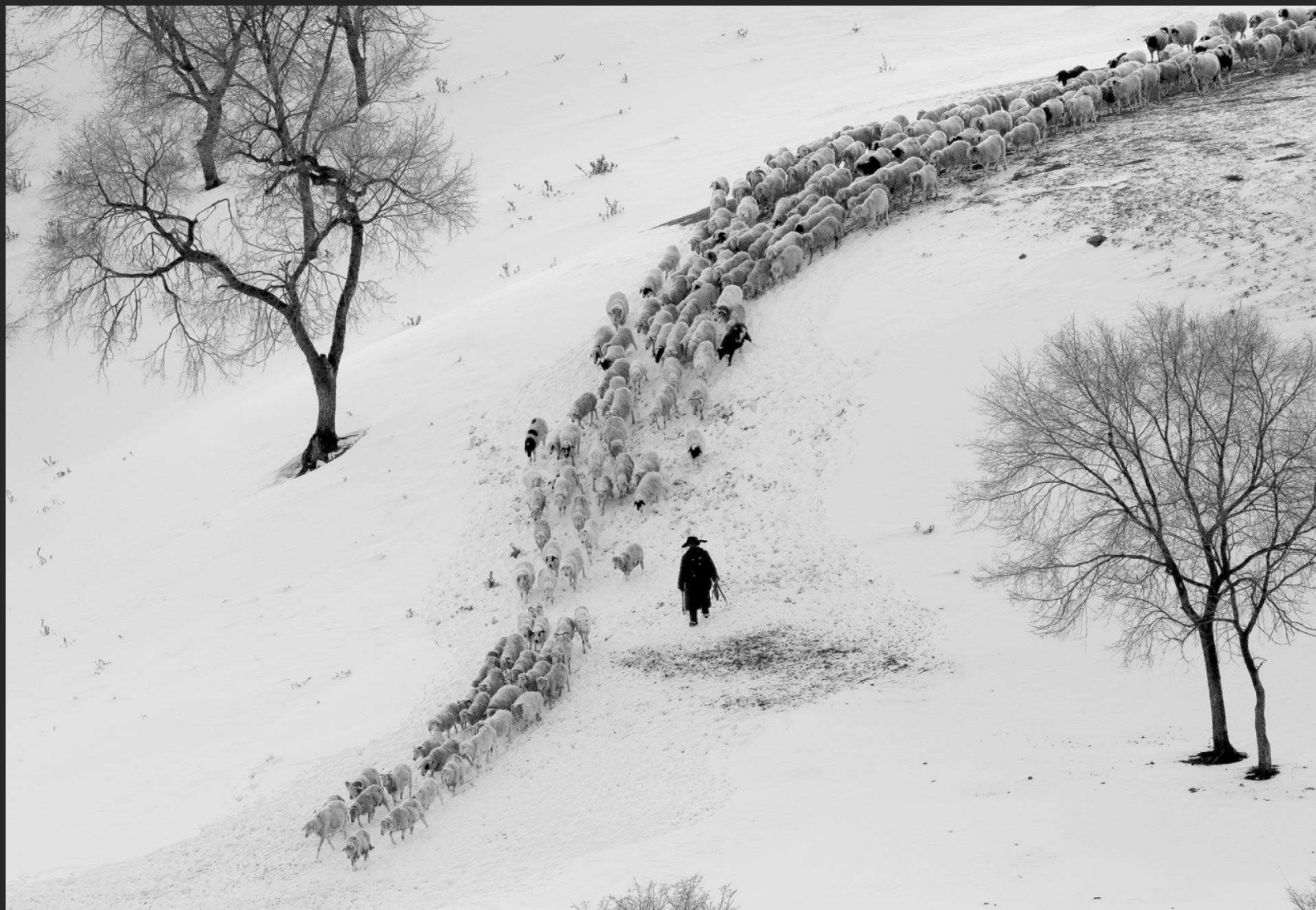
WANG LI, CHINA - HERDING SHEEP-BW - FIAP GOLD MEDAL – UJJAIN