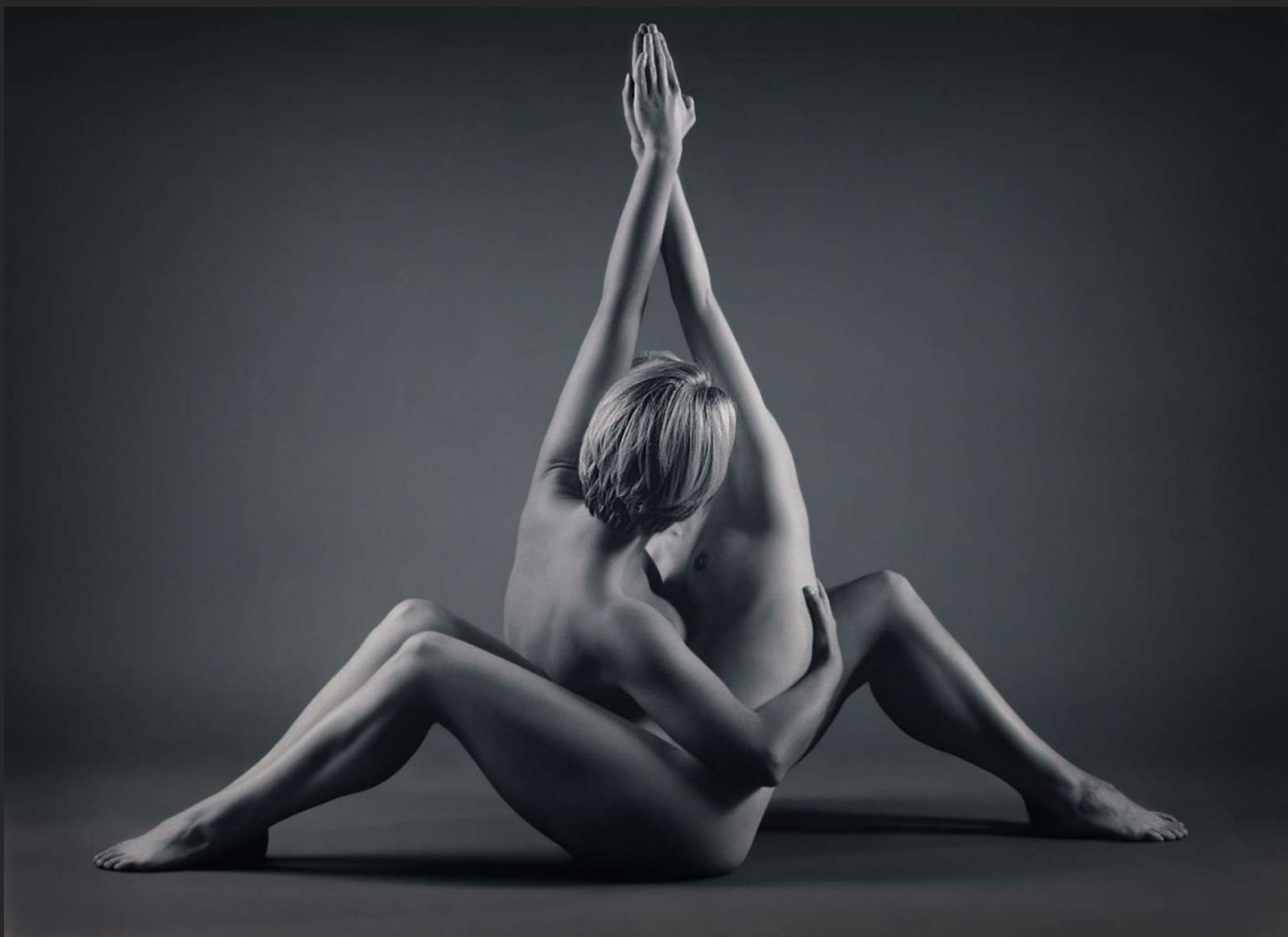
PARIS RAIMUND, GERMANY - SISTERS - PSA BEST OF SHOW – INDORE