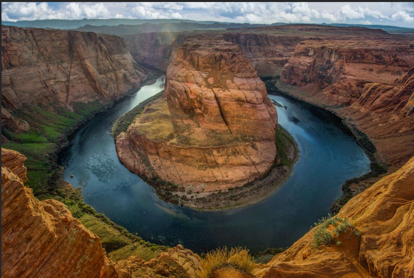
KING FRANCIS, CANADA - HORSESHOE BEND - PSA BEST OF SHOW – UJJAIN