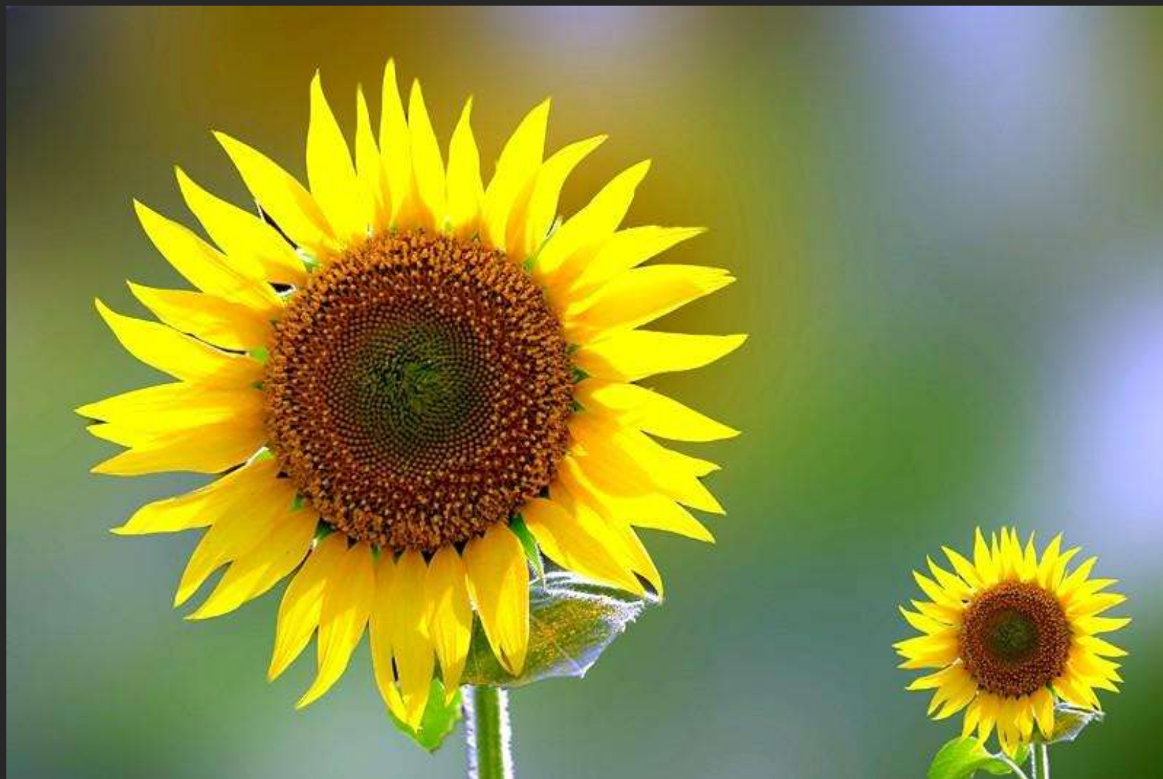
DAS APURBA, INDIA - SUN FLOWER 2 - FIAP GOLD MEDAL – BHOPAL