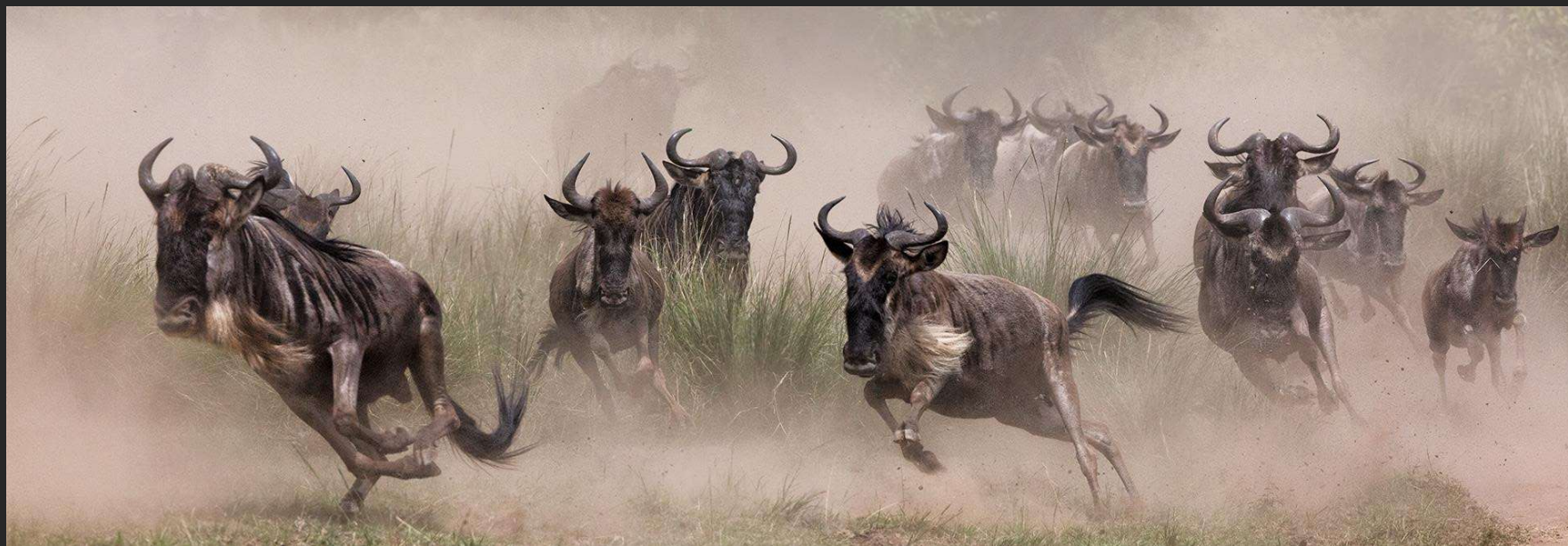
MOHANRAJ ARUN, UNITED KINGDOM - WILDEBEESTS MIGRATION KENYA - FIAP SILVER MEDAL – INDORE