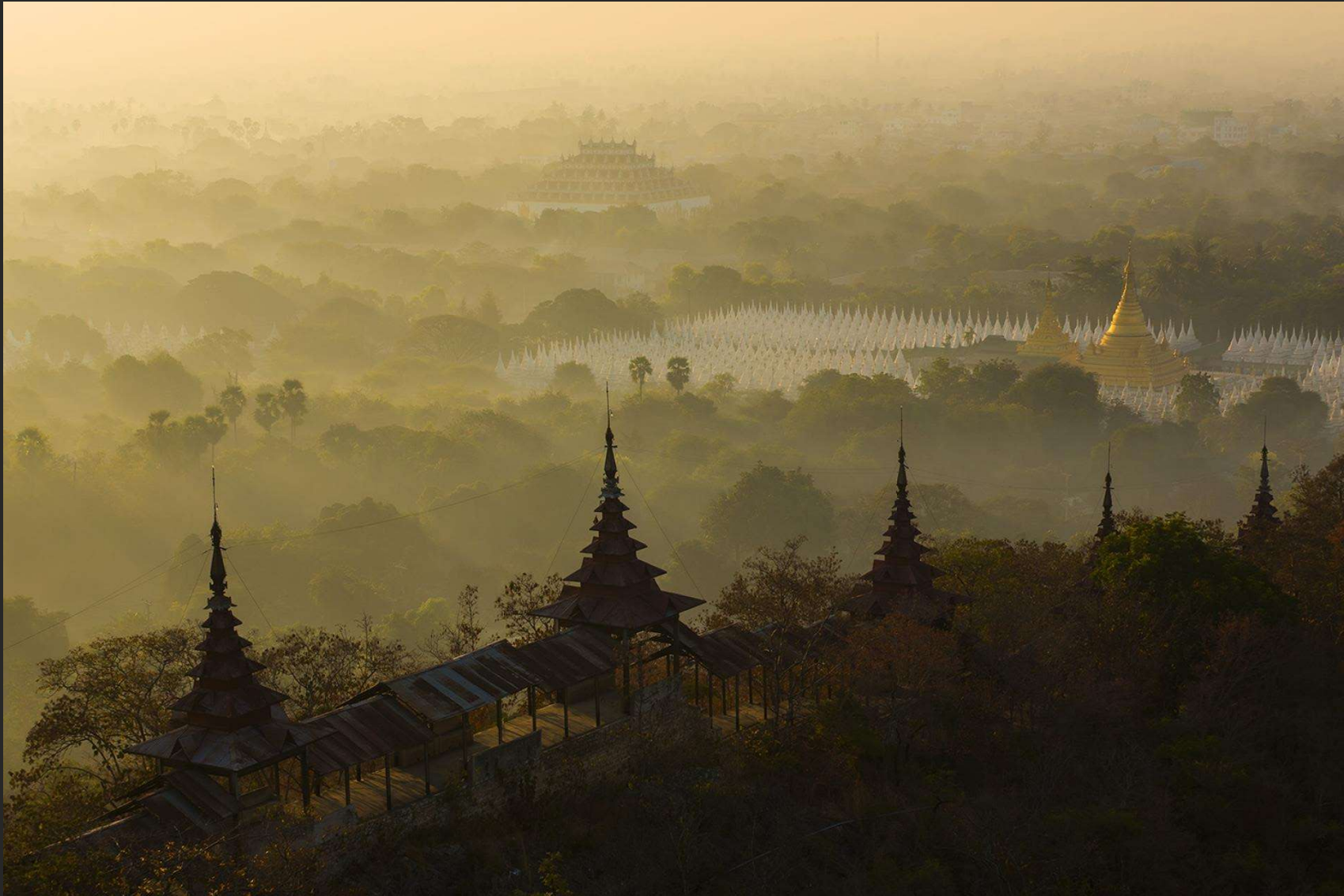
WANG ROSALIE, UNITED STATES - MORNING MIST OVER MANDALAY - FIAP SILVER MEDAL – UJJAIN