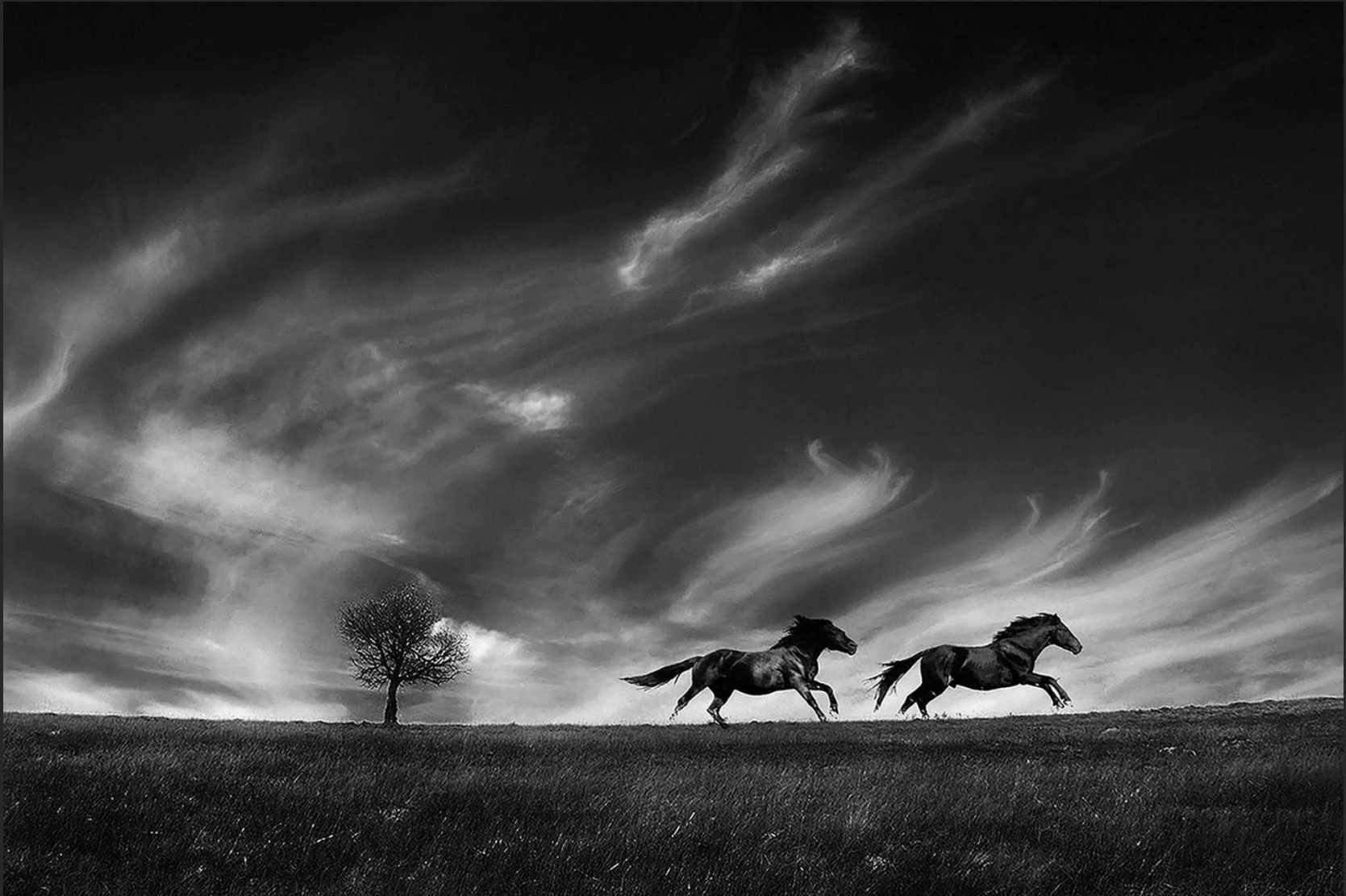
NAGY LAJOS, ROMANIA - RUNNING WITH THE WIND - FIAP SILVER MEDAL – BHOPAL