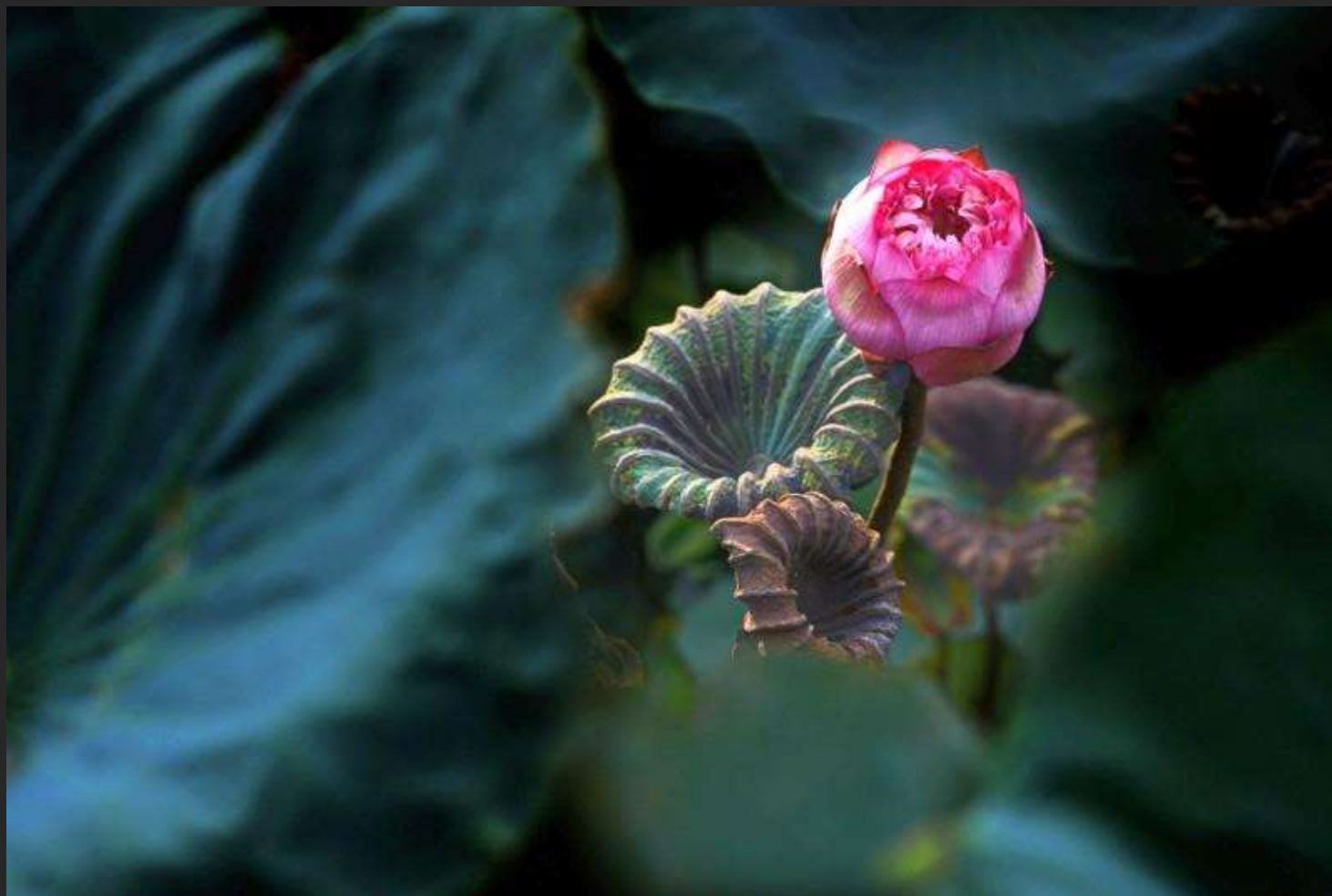
CHEN JINGHUI, CHINA - BIUTIFUL - PSA BEST OF SHOW – BHOPAL