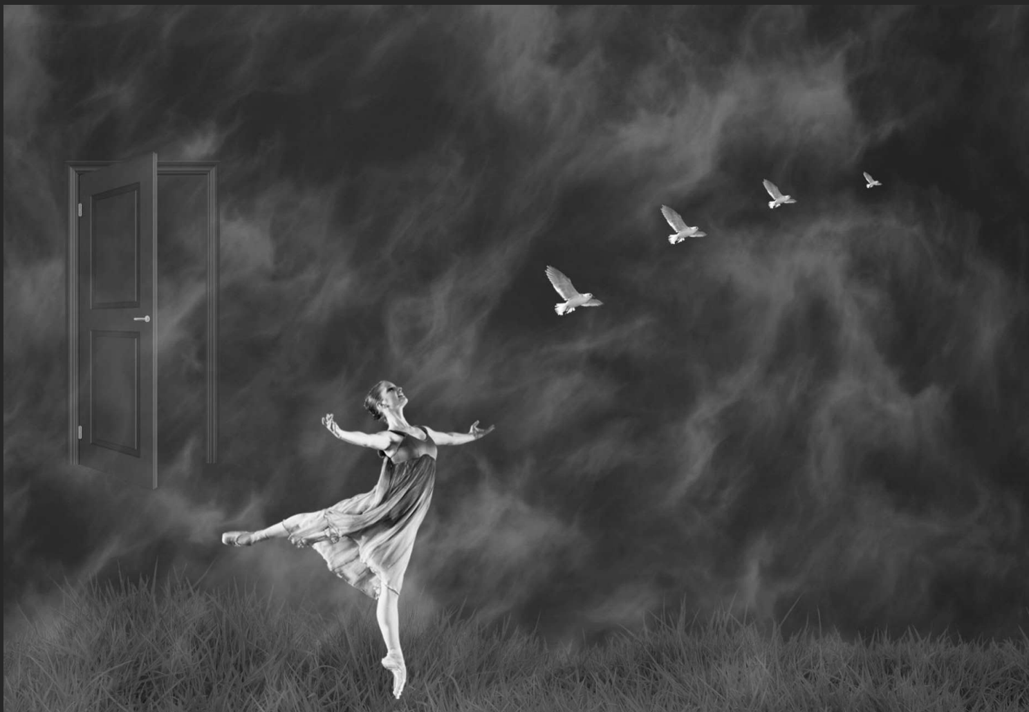
DUTTA CHINMOY, INDIA – FREEDOM - PSA BEST OF SHOW – BHOPAL