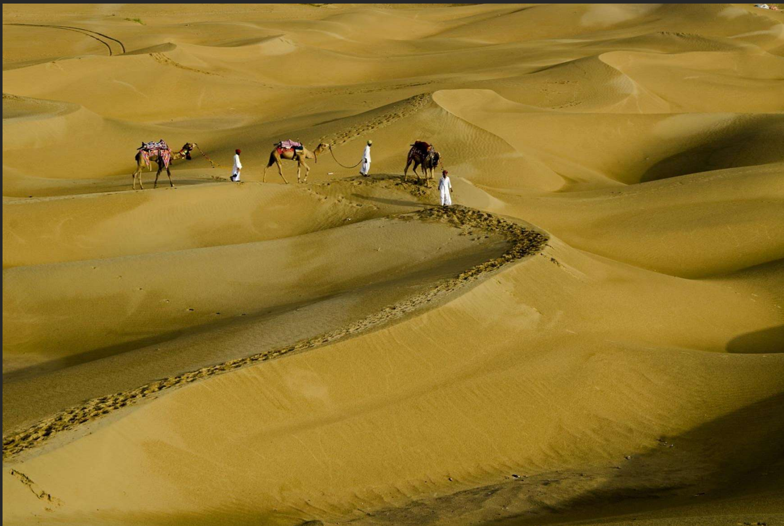
JOSHI SARAVESH, INDIA - THAR - PSA BEST OF SHOW – INDORE