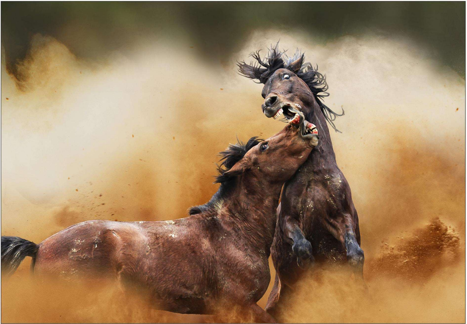
TAM JOSEPH, AUSTRALIA - HAVE NO FEAR - FIAP SILVER MEDAL – INDORE