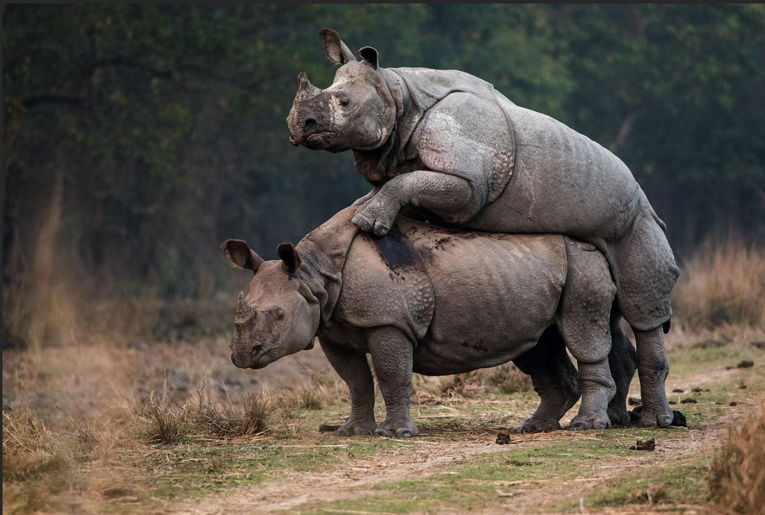
DAS ASHOK KUMAR, INDIA - RHINO MATING - PSA BEST OF SHOW – INDORE