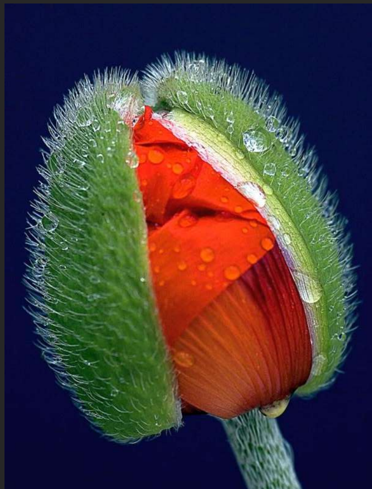
JENZER URS, SWITZERLAND - MOHN 2 - PSA BEST OF SHOW – UJJAIN