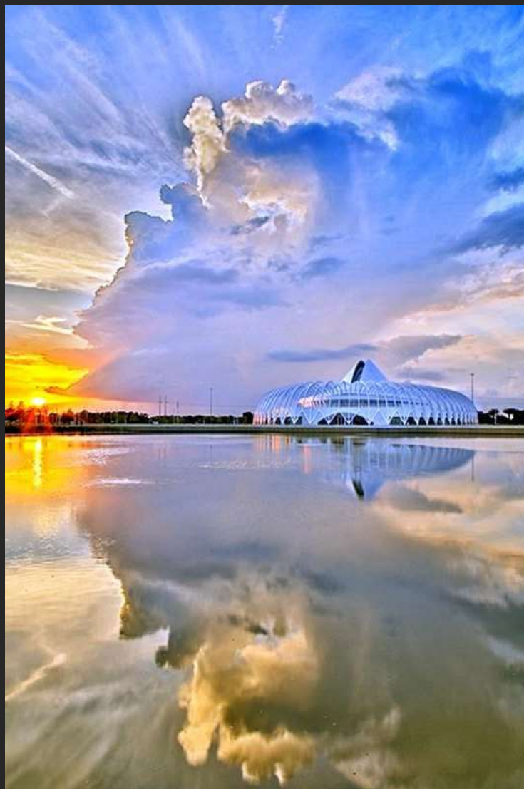
THAI MINH TAN, UNITED STATES - YELLOW SUNSET - FIAP SILVER MEDAL – INDORE