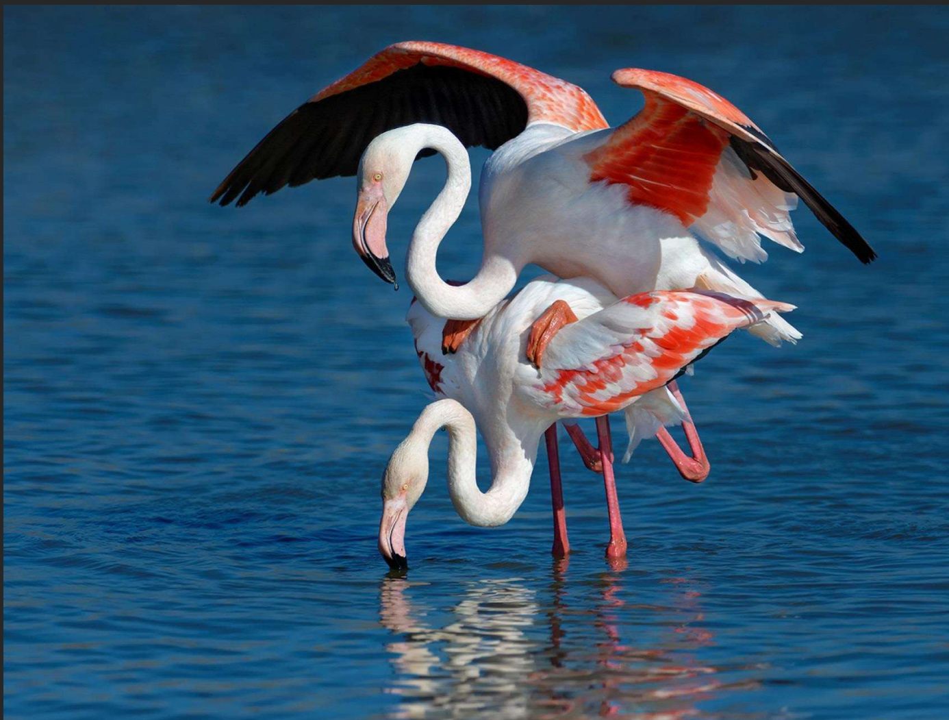
JOURDAIN ROGER, FRANCE - MATING PINK FLAMINGOS 2015 - PSA BEST OF SHOW – BHOPAL