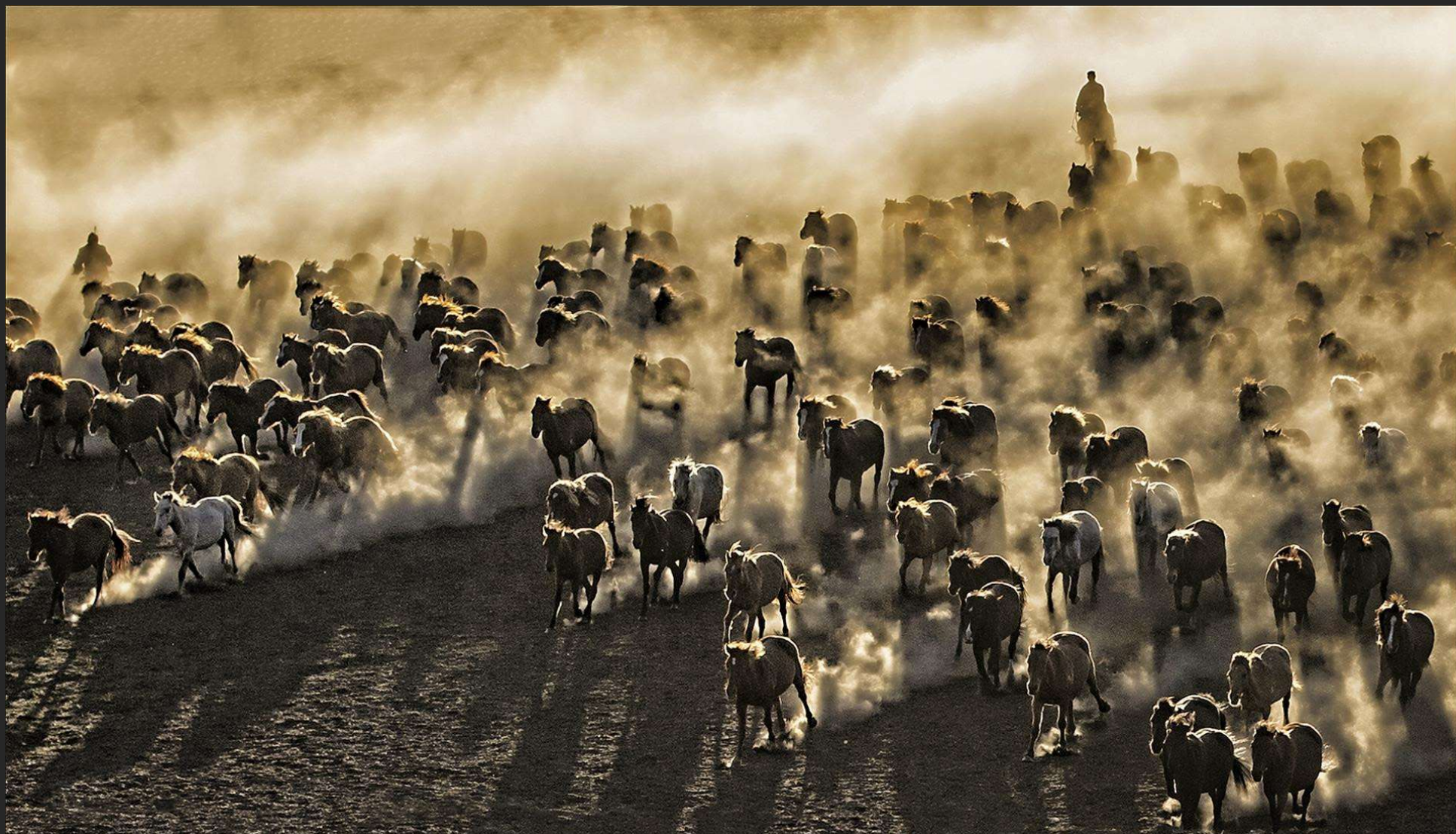
CHAN DANY, CANADA - HORSE ROUND UP 100 - FIAP GOLD MEDAL – BHOPAL