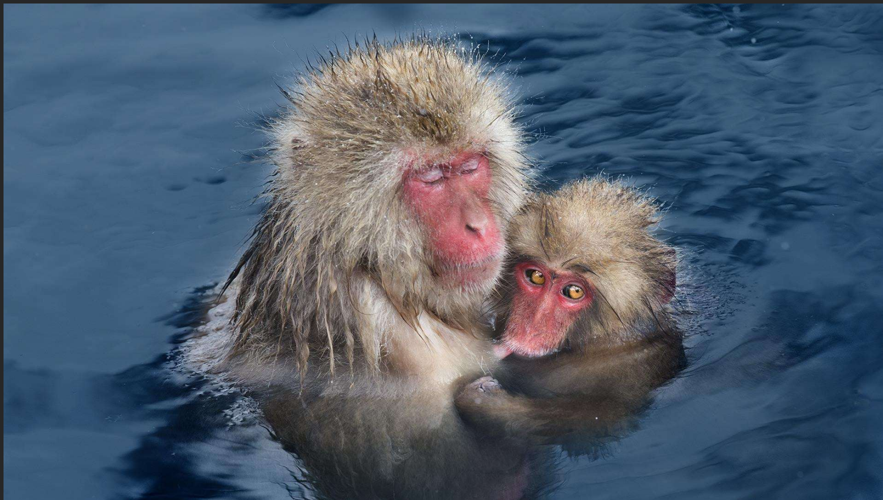
CHAN HW, HONG KONG - BREAST-FEED 17 - FIAP SILVER MEDAL – UJJAIN