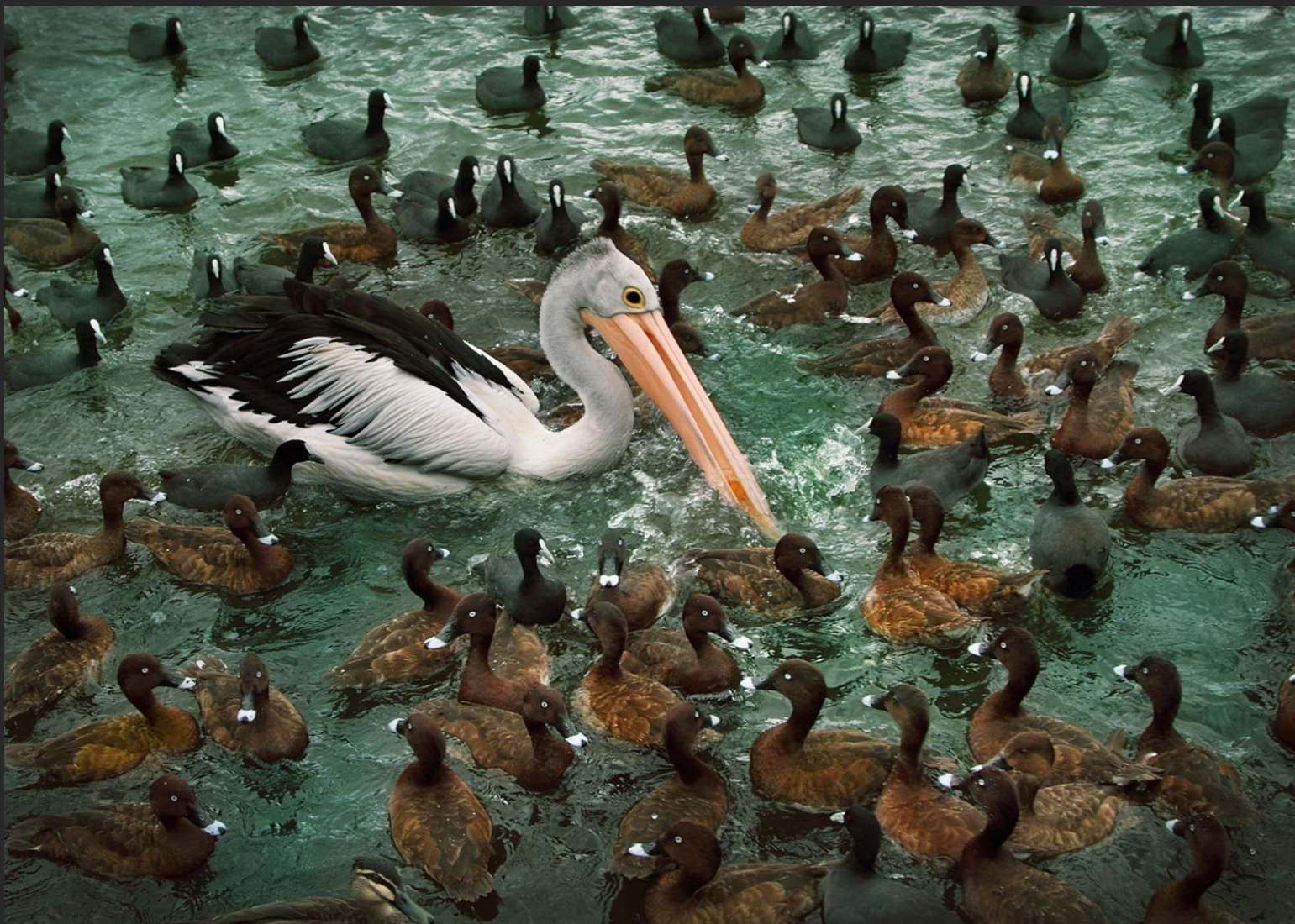
LI YONG ZHI, AUSTRALIA - BIG AND SMALL - FIAP GOLD MEDAL – UJJAIN