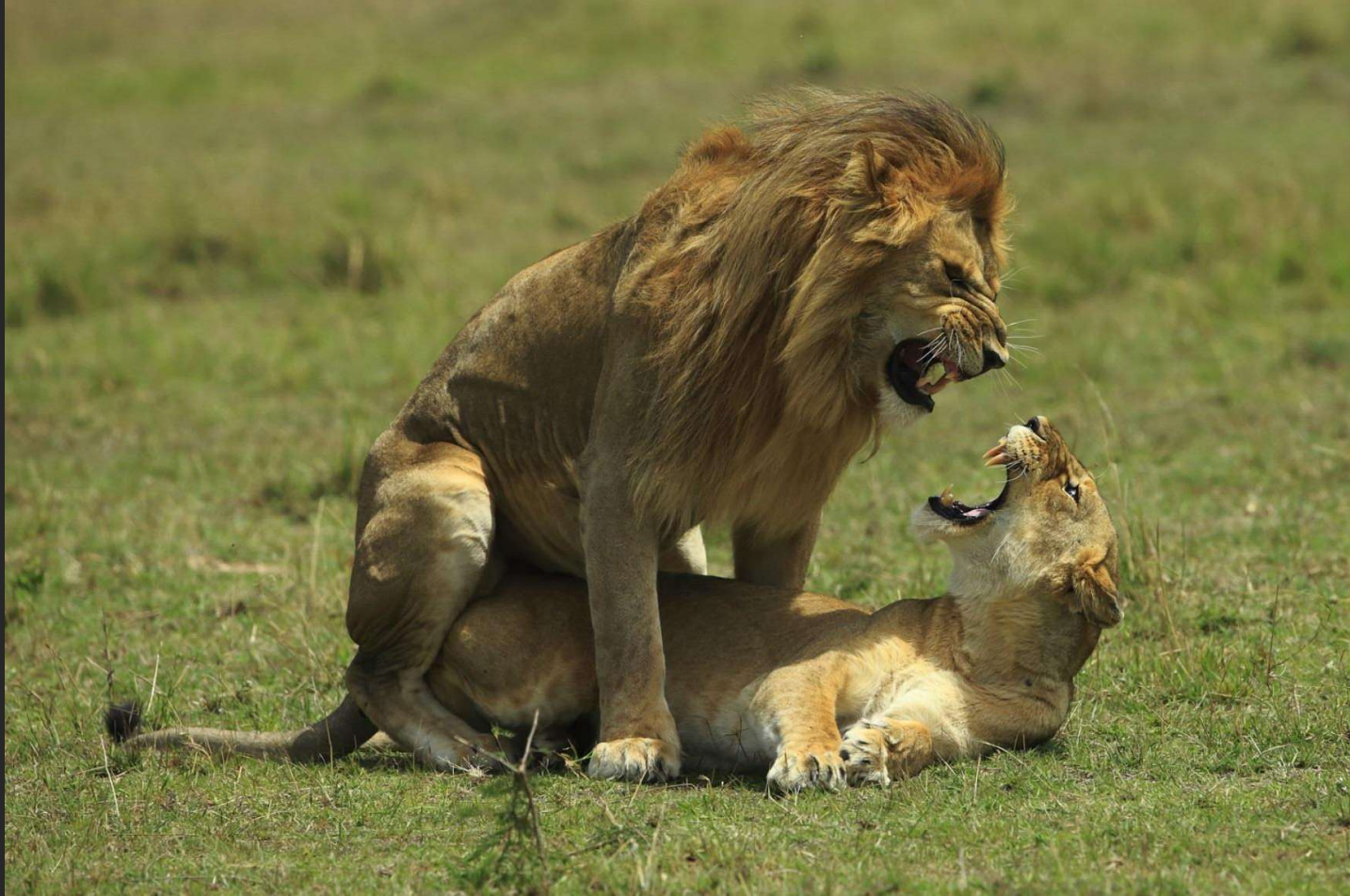
1 DEVINE BOB, UNITED KINGDOM - LION LOVE - PSA BEST OF SHOW – UJJAIN