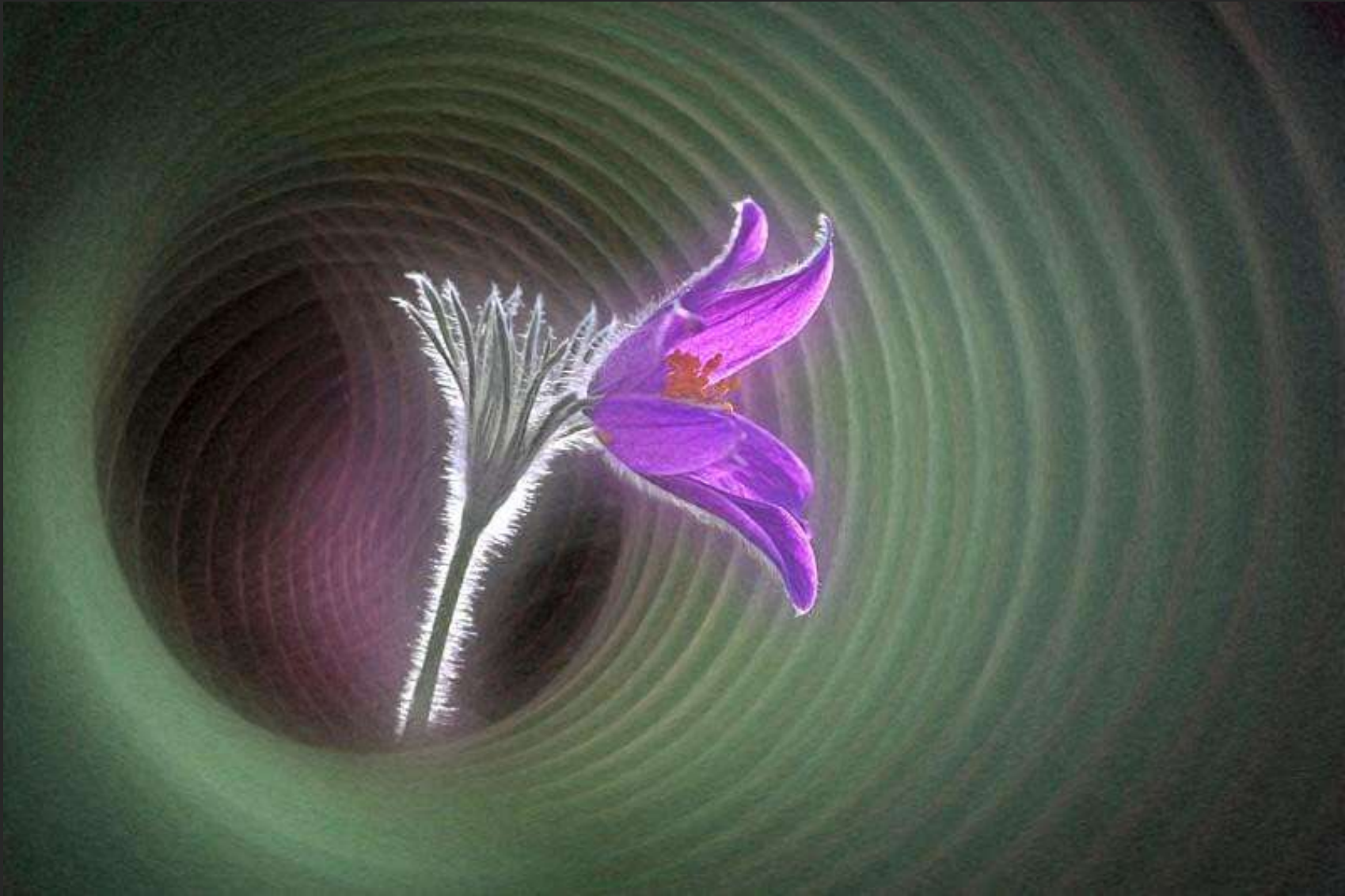
HARRISON COLIN, UNITED KINGDOM - SPRING PASQUE - FIAP SILVER MEDAL – UJJAIN