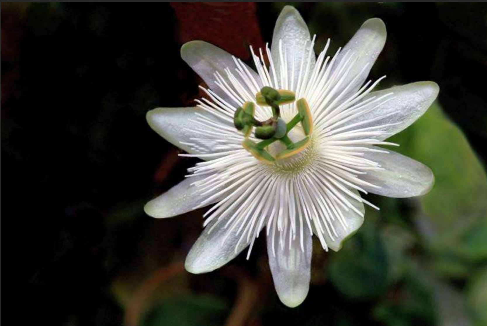
AMIN SHAIKH, PAKISTAN - WHITE BEAUTY - FIAP SILVER MEDAL – BHOPAL