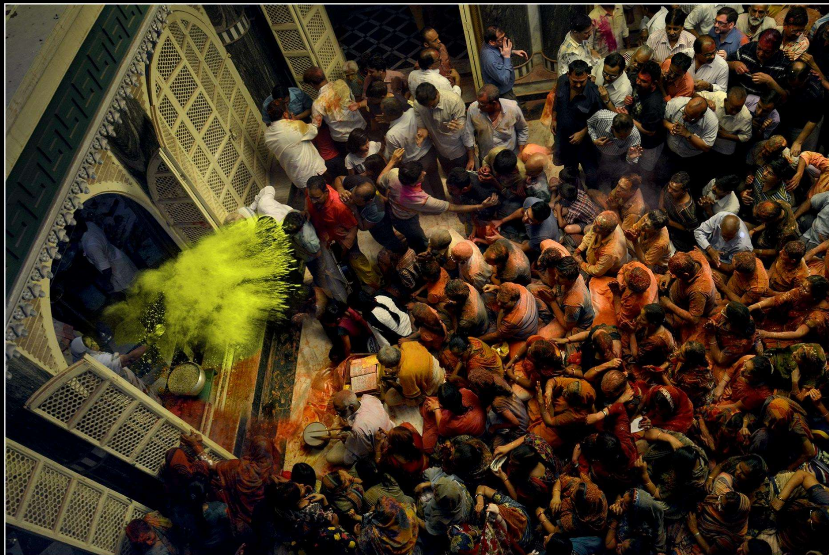
MITRA INDRAJIT, INDIA - COLORS OF HOLI - FIAP SILVER MEDAL – BHOPAL